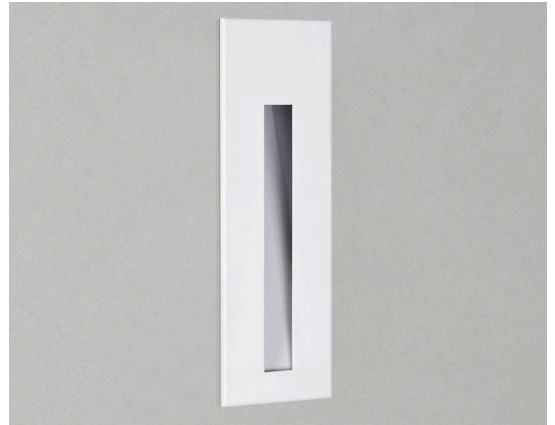
CODE: 1212031 FINISH: MATT WHITE

TO MAINTAIN THIS PRODUCT TO ITS BEST CONDITION, PLEASE VIEW OUR CARE AND CLEANING GUIDE ON THE SUPPORT SECTION OF THE ASTRO WEBSITE.